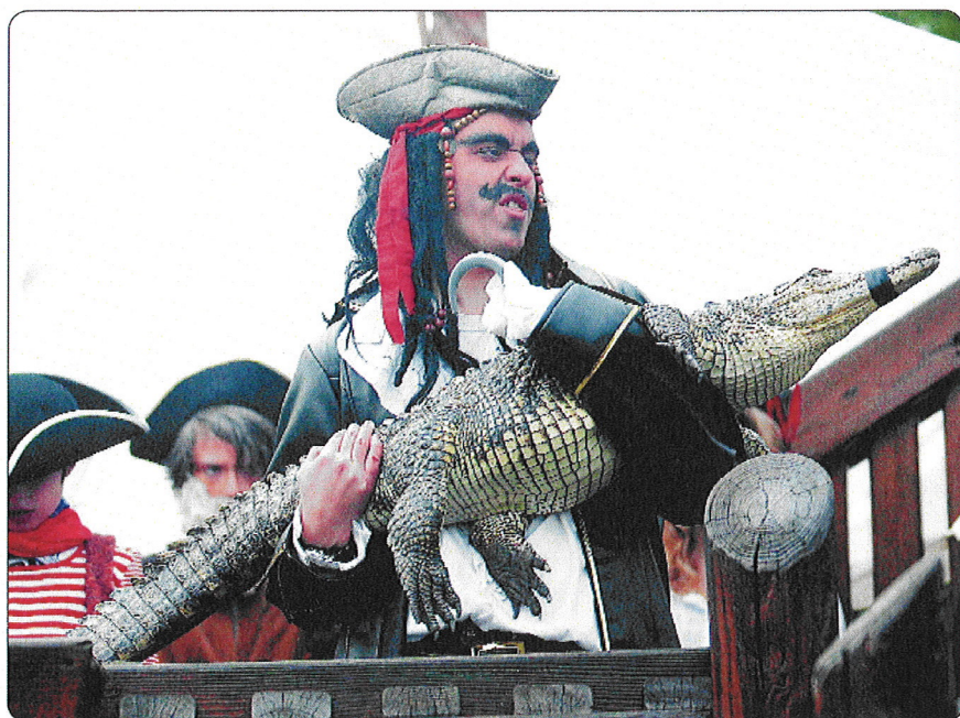
ADVANCE photo by BRIAN FORDE